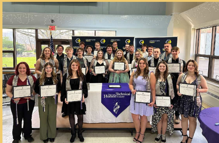
Congratulations to our 2024 NTHS Inductees!